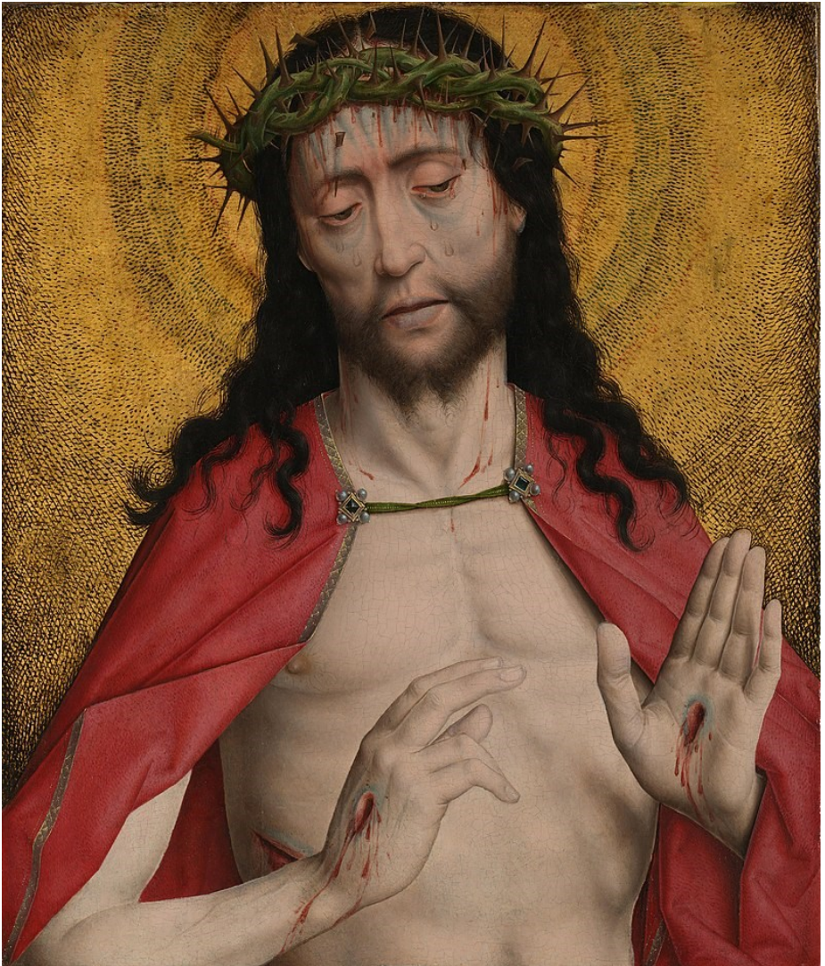
Image: Dieric Bouts (c.1420–75), Christ Crowned with Thorns (National Gallery, London) Wikimedia Commons, public domain